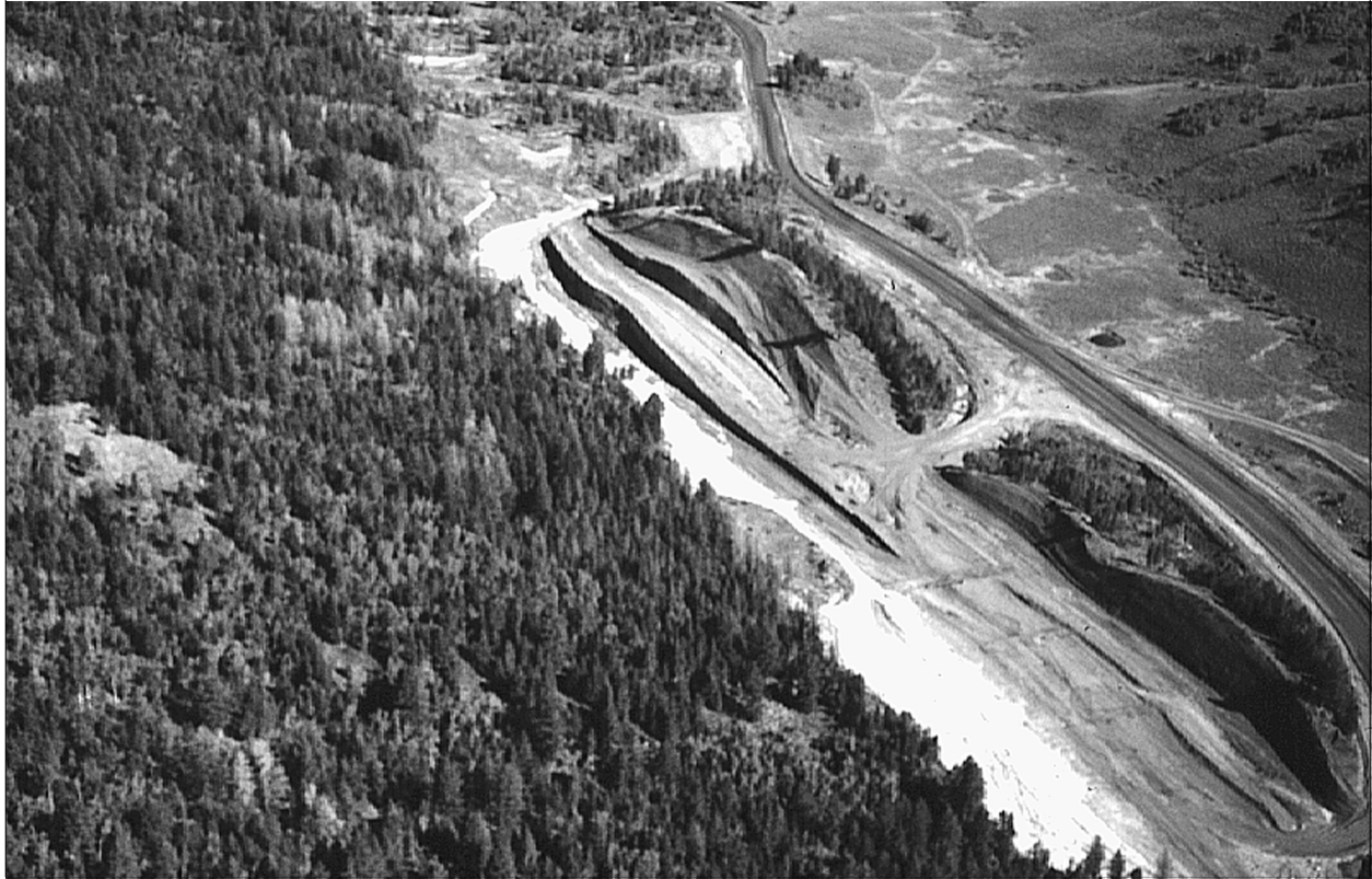
Figure 175. Aerial view of Little Long Valley Mine, August, 1978.

new mine. There, the ore was carried downhill to the rail loading facility and then hauled to the Stauffer mill at Silver Bow, Montana.