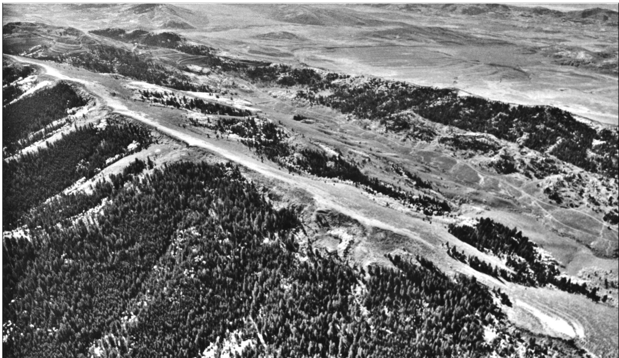
Figure 174. Site of the Little Long Valley Mine (pre-mining), view northeast, 1973.

Mining on Lease I-97 occurred on 2 of the 3 parcels. Parcel 1, or the northernmost parcel, produced ore, Parcel 2, or the central parcel, was acquired to cover segments of Lease I-04373 pit footwall which extended off-lease, and Parcel 3, the southernmost, was found to be barren of phosphate.